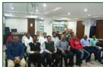
Audience at 18th November 2017