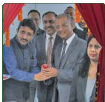
Inauguration of Classroom at EIRC Premises at Russell Street