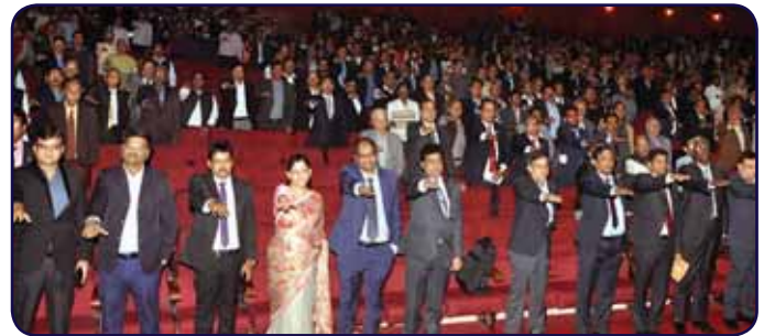
Pledge on Swachh Bharat as taken by the delegates