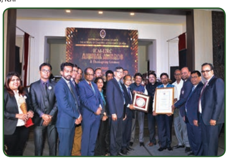
{\sf Best\ Branch\ (Large\ \&\ Medium\ Category) - Siliguri\ Branch\ of\ EIRC}