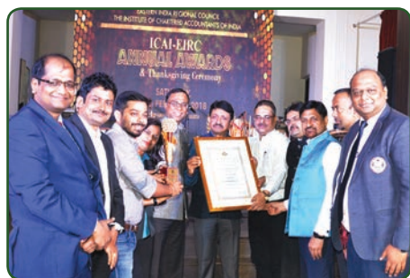
Best Student Association (Small Category) — Rourkela Branch of EICASA of EIRC