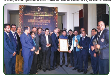
Best Student Association (Large & Medium Category) — Siliguri Branch of EICASA of EIRC