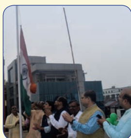
Hoisting the National Tricolour