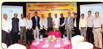
Lighting the Inaugural Lamp