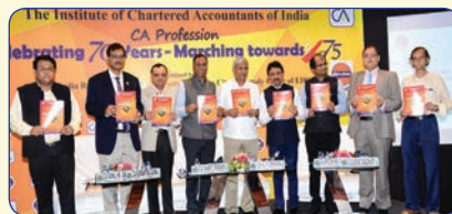
Releasing the Official Souvenir