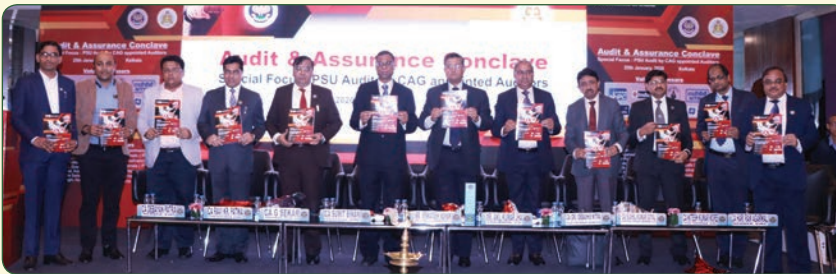
Releasing the Official Souvenir