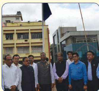
ICAI Flag Hoisting