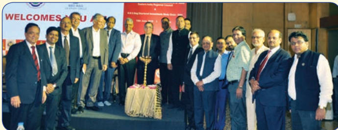
Lighting the Inauguration Lamp