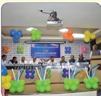
Awareness Programme on Organ Donation