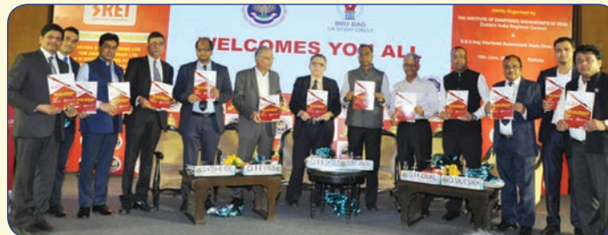
Releasing the Official Souvenir