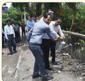
Plantation of Saplings