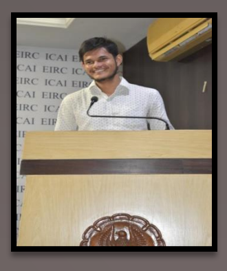
SK Saddam Hussain